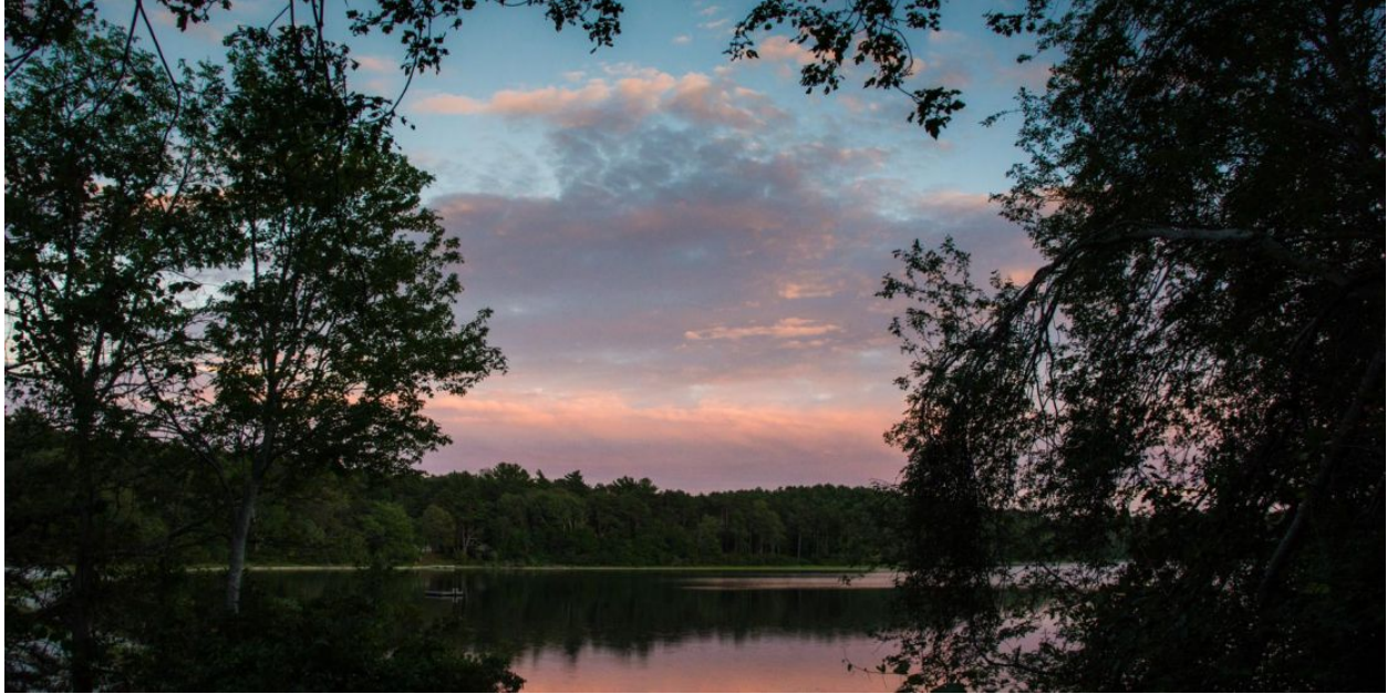
Sunset over lake at Camp Burgess on Cape Cod